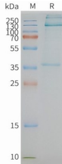
Figure2. Human ADGRE1-Nanodisc, Flag Tag on SDS-PAGE