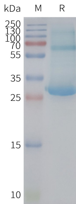
Figure 2. Human ADGRE5-Nanodisc, Flag Tag on SDS-PAGE