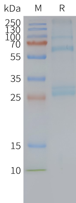
Figure 2. Human ADGRG1-Nanodisc, Flag Tag on SDS-PAGE