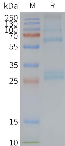
Figure 2. Human ADGRG1-Nanodisc, Flag Tag on SDS-PAGE