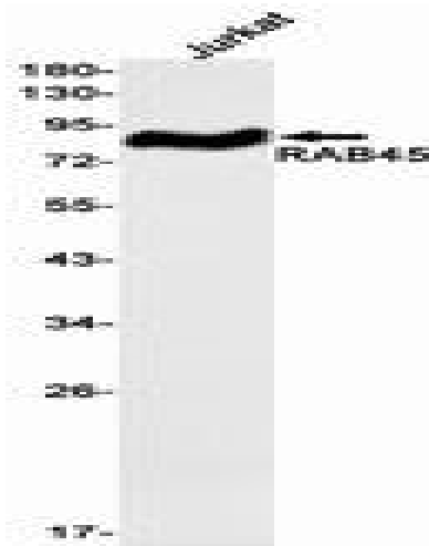
Western blot analysis of RAB45 in Jurkat lysates using RAB45 antibody.