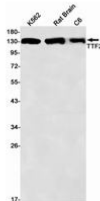
Western blot analysis of TTF2 in K562, rat Brain, C6 lysates using Transcription Termination Factor 2 antibody.