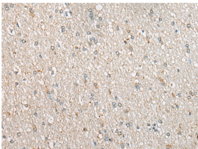
Immunohistochemistry analysis of paraffin embedded Human brain tissue using 221082(UGT1A4 Antibody) at a dilution of 1/30(Cell membrane).

Storage & Shipping: Store at -20°C. Avoid repeated freezing and thawing