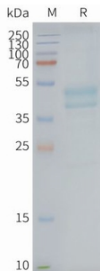
Figure2. Human C5AR1-Nanodisc, Flag Tag on SDS-PAGE