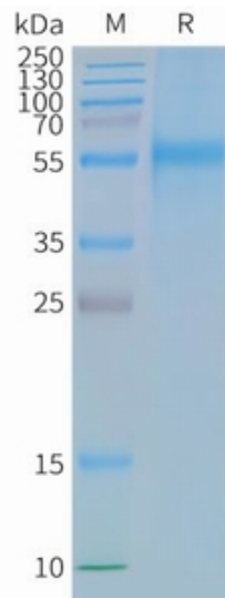
Figure2. Human CCR9-Nanodisc, Flag Tag on SDS-PAGE