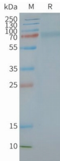
Figure2. Human CGRPR-RAMP1-Nanodisc, Flag Tag on SDS-PAGE