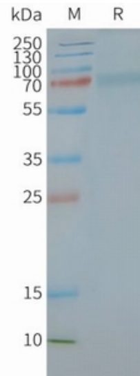
Figure2. Human CGRPR-RAMP1-Nanodisc, Flag Tag on SDS-PAGE