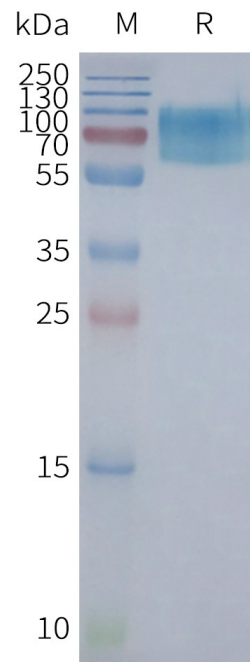
Figure 2. Human CHRM2-Nanodisc, Flag Tag on SDS-PAGE