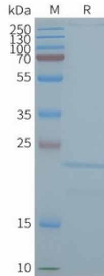
Figure2. Human CLDN2-Nanodisc, Flag Tag on SDS-PAGE