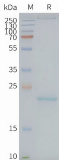
Figure2. Human CLDN9-Nanodisc, Flag Tag on SDS-PAGE