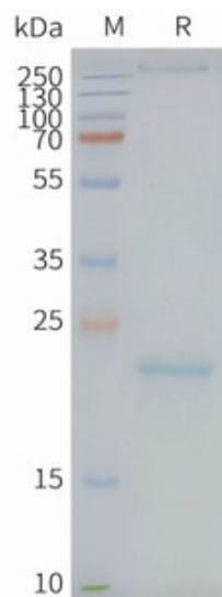
Figure2. Human CLDN9-Nanodisc, Flag Tag on SDS-PAGE