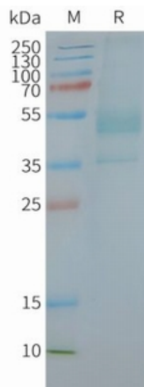
Figure2. Human CXCR2-Nanodisc, Flag Tag on SDS-PAGE