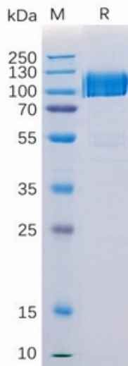
Figure 1. Human AXL Protein, hFc Tag on SDS-PAGE under reducing condition.