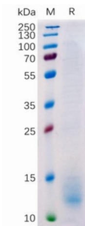
Figure 1. Human BCMA Protein, His Tag on SDS-PAGE under reducing condition.

Storage & Shipping: Store at -20°C to -80°C for 12 months in lyophilized form. After reconstitution, if not intended for use within a month, aliquot and store at -80°C (Avoid repeated freezing and thawing). Lyophilized proteins are shipped at ambient temperature.