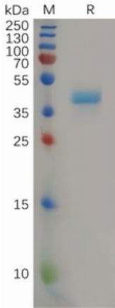
Figure 1. Human CCR8 Protein, hFc Tag on SDS-PAGE under reducing condition.