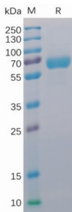
Figure 1. Human CD48 Protein, mFc-His Tag on SDS-PAGE under reducing condition.

Storage & Shipping: Store at -20°C to -80°C for 12 months in lyophilized form. After reconstitution, if not intended for use within a month, aliquot and store at -80°C (Avoid repeated freezing and thawing). Lyophilized proteins are shipped at ambient temperature.