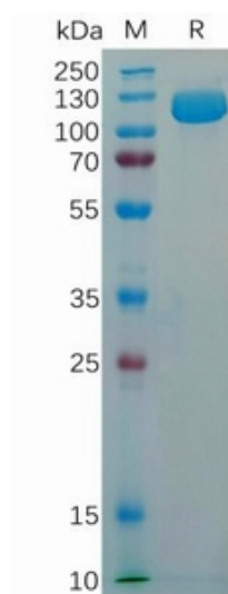
Figure 1. Human CD56 Protein, His Tag on SDS-PAGE under reducing condition.