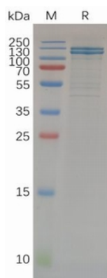
Figure 1. Human CDH1 Protein, hFc Tag on SDS-PAGE under reducing condition.

Storage & Shipping: Store at -20°C to -80°C for 12 months in lyophilized form. After reconstitution, if not intended for use within a month, aliquot and store at -80°C (Avoid repeated freezing and thawing). Lyophilized proteins are shipped at ambient temperature.