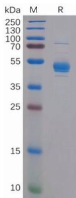
Figure 1. Human CLEC2D Protein, hFc Tag on SDS-PAGE under reducing condition.

Storage & Shipping: Store at -20°C to -80°C for 12 months in lyophilized form. After reconstitution, if not intended for use within a month, aliquot and store at -80°C (Avoid repeated freezing and thawing). Lyophilized proteins are shipped at ambient temperature.