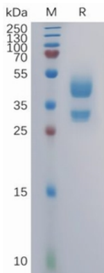
Figure 1. Human CXCR3 Protein, mFc Tag on SDS-PAGE under reducing condition.

Storage & Shipping: Store at -20°C to -80°C for 12 months in lyophilized form. After reconstitution, if not intended for use within a month, aliquot and store at -80°C (Avoid repeated freezing and thawing). Lyophilized proteins are shipped at ambient temperature.