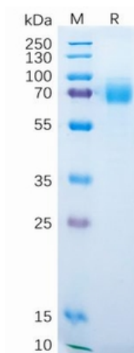
Figure 1. Human DKK1 Protein, hFc Tag on SDS-PAGE under reducing condition.