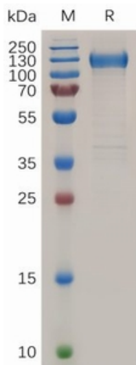
Figure 1. Human FLT1 Protein, His Tag on SDS-PAGE under reducing condition.