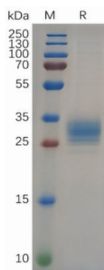
Figure 1. Human FOLR2 Protein, His Tag on SDS-PAGE under reducing condition.

Storage & Shipping: Store at -20°C to -80°C for 12 months in lyophilized form. After reconstitution, if not intended for use within a month, aliquot and store at -80°C (Avoid repeated freezing and thawing). Lyophilized proteins are shipped at ambient temperature.