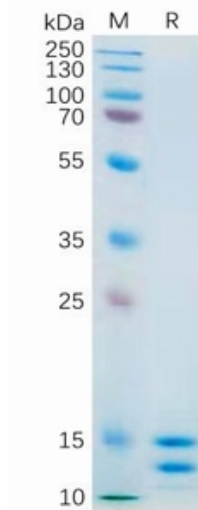
Figure 1. Human IL2 Protein, His Tag on SDS-PAGE under reducing condition.