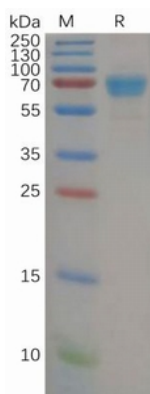
Figure 1. Human IL21R Protein, mFc Tag on SDS-PAGE under reducing condition

Storage & Shipping: Store at -20°C to -80°C for 12 months in lyophilized form. After reconstitution, if not intended for use within a month, aliquot and store at -80°C (Avoid repeated freezing and thawing). Lyophilized proteins are shipped at ambient temperature.