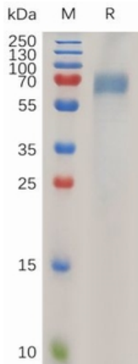
Figure 1. Human LILRB2 Protein, His Tag on SDS-PAGE under reducing condition.