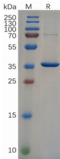
Figure 1. Human NEFL(89-400) Protein, His Tag on SDS-PAGE under reducing condition.