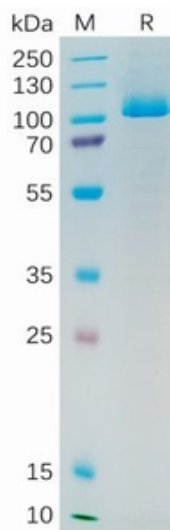
Figure 1. Human PSMA Protein, His Tag on SDS-PAGE under reducing condition.