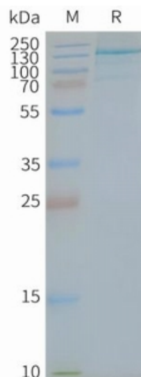
Figure2. Human TLR7-Nanodisc, Flag Tag on SDS-PAGE