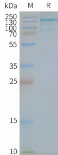
Figure2. Human TLR7-Nanodisc, Flag Tag on SDS-PAGE